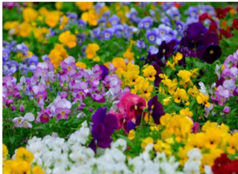
▲ Annual plants, like violas (pictured above) complete their life cycle in one season.

When beautifying your yard, one key decision is whether to opt for annual or perennial plants. Each type offers its own set of benefits and considerations, making the choice important for any homeowner with a garden.